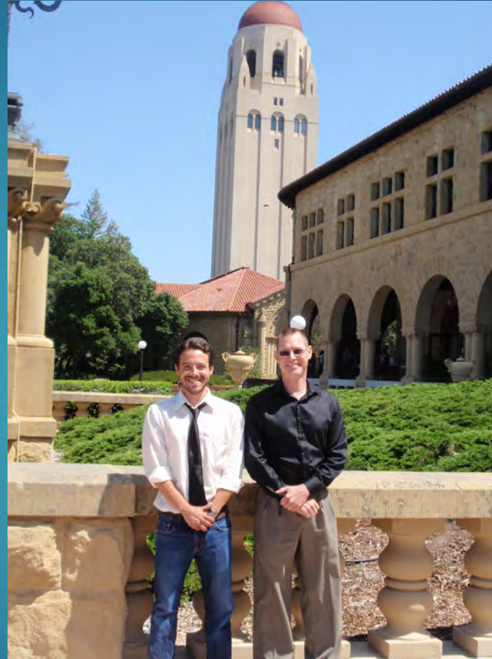
CRC Honors student and Honors coordinator attend an event at Stanford University

Honors provides enhanced counseling as well as career and academic advising in support of transfer and subsequent graduate and professional school admission .