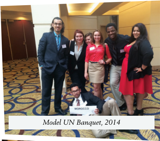
Model UN Banquet, 2014