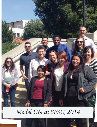
Model UN at SFSU, 2014