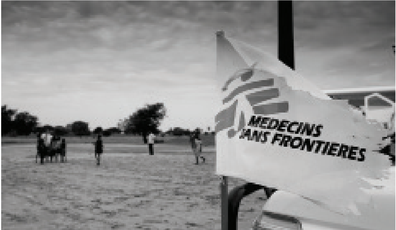
Medecins Sans Frontieres

victims. 4 In 1971, thirteen doctors and journalists came together and organized a composed NGO with a top down structure that we still recognize within MSF today. Unfortunately, during MSF's early years, there was an internal struggle between founders. Doctor Bernard Kouchner wanted to document and broadcast the suffering within countries and believed that this was the most effective way to solve the problems these countries were facing internally. Opposing ideas came from Doctor Claude Malhuret who was elected president of MSF in 1977. He believed that MSF should avoid criticizing the governments of the countries they were present in and he downplayed the importance of témoignage or "witnessing". Doctor Kouchner truly believed that speaking out was the bona fide course of action, "By keeping silent, we doctors are accomplices in the systematic massacre of a population." When Doctor Malhuret insisted on his approach, Doctor Kouchner left MSF and started his own NGO, Médecins du Monde. Sadly, we see this internal struggle is still the source of much issue within MSF today.