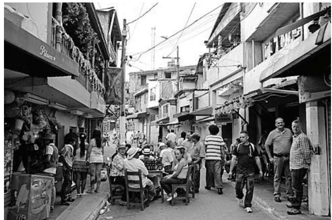
People celebrating in the streets, Comuna 13, Medellín, Colombia.

Crime Prevention Education attempts to inform and engage individuals and communities on the nature of crime and the state security apparatus. In this approach, a significant emphasis is placed on community cooperation and oversight, as well as situational awareness on the part of the individual. 20 This approach is especially relevant considering recent drops in the public's perception of security, which has been compounded by a long-term distrust of police and security forces in Medellín. Yet, with a combination of Crime Prevention Education and Social