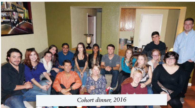
Cohort dinner, 2016