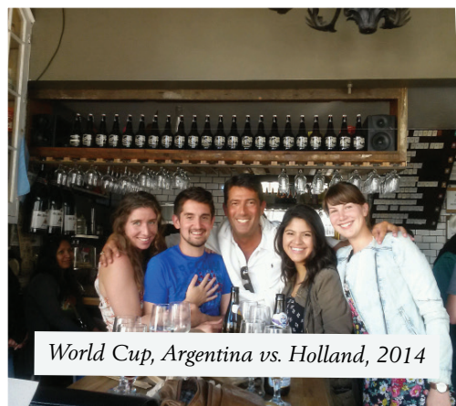
World Cup, Argentina vs. Holland, 2014