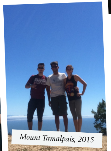
Mount Tamalpais, 2015