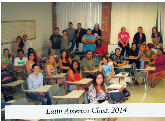
Latin America Class, 2014