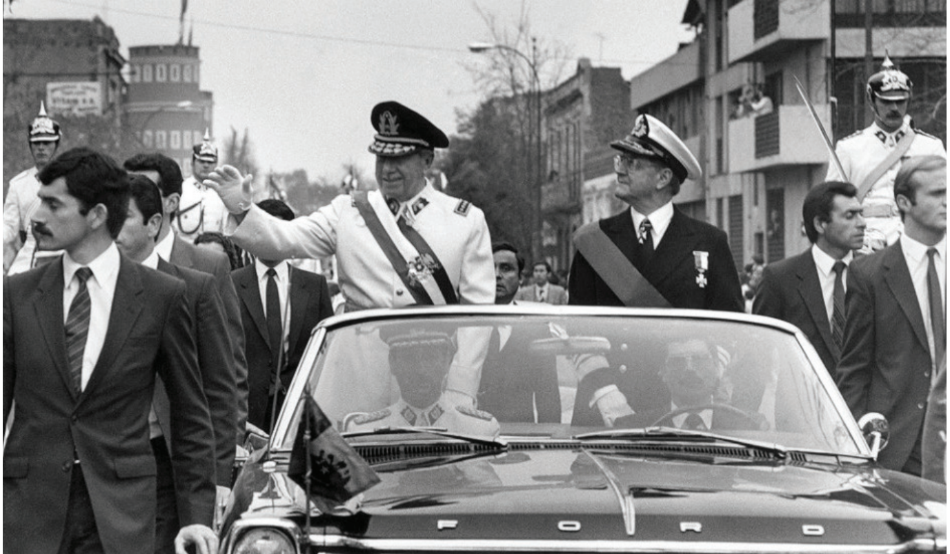
General Augusto Pinochet

The terror and horror that this country witnessed brings forth the tension and heartache that the Chilean people experience. Though it has been nearly 43 years since the coup, Chilean culture, along with the heart of the country, has changed. Chile, after Pinochet, hasn't been quite the same. Pinochet left the state having to start from scratch and fix the holes he created in the country in terms of economic and social programs.