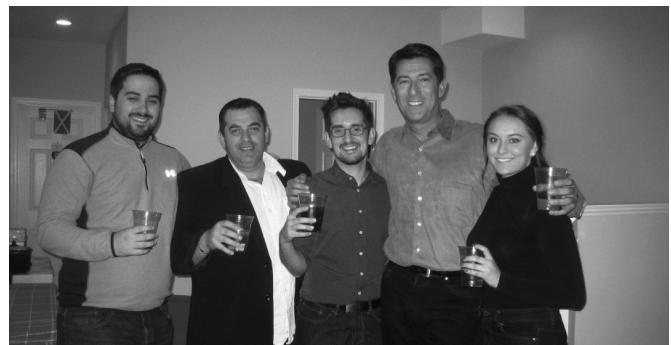
Thanksgiving 2015, Washington DC

As with prior years, we've been able to attend several local (SF) cultural events and films with students. Campus tours for this year's transfers were not necessary as decisions were already made based on familiarity with institutions.