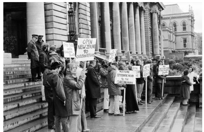
Protests in New Zealand calling for Chilean refugee access.

In many ways the struggles and challenges of return migration are social constructions that were created by those involved. These constructs help those involved identify with the world around them; people give them meaning and then, in part, they find their identity and their place through those objects. This theory of constructivism was created by Alexander Wendt, who states that “it is collective meanings that constitute the structures which organize our actions.” 10 When returnees go back to the homeland, they