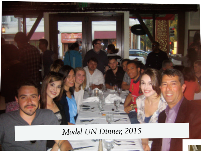
Model UN Dinner, 2015