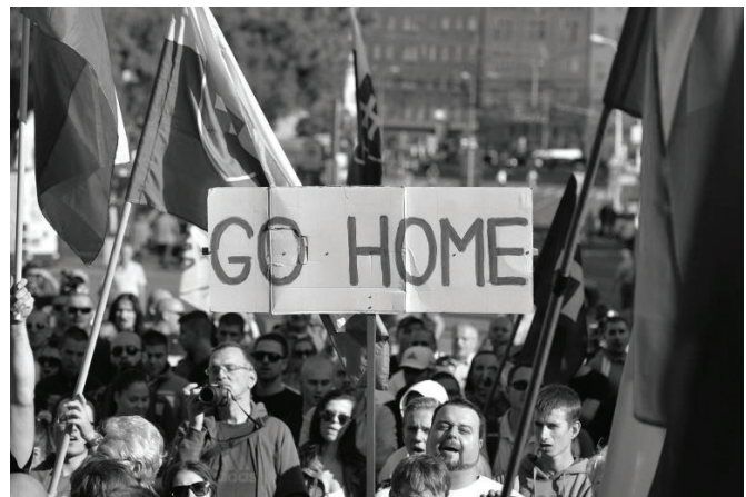
A rally organized by the group Stop Islamisation of Europe and backed by far-right politicians in Slovakia.

Nationalist groups have sparked anger in the people causing protests and fomenting violent acts against refugees and asylum seekers across Europe. In Clausnitz, Germany of February 2016, a group of protesters tried to block a bus carrying 20 asylum seekers while chanting, “we are the people” - angry that more refugees were entering and invading Greece. 12 In the same month a hotel in Greece that was supposed to shelter 300 refugees was set on fire in hopes of keeping the refugees away. On April 11th, NPR’s Peter