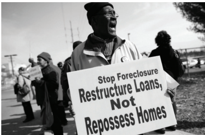
A 2009 foreclosure protest in East Meadow, New York.

communities with low socioeconomic status (SES) have produced much different academic results than schools that resided in areas boasting a higher socioeconomic status. 24 African American, Latino, and American Indian students in low SES schools have consistently underachieved when measured on the basis of standardized testing among all grade levels, kindergarten through grade twelve, compared to higher SES schools in suburban areas. 25 Drop-out rates of ethnic minorities in low SES areas remain high, near 50%, and has contributed to 46-54% of all black, Latino, and American Indian 12th grade students not meeting basic reading proficiency standards, while their white counterparts suffer half the previous rate. 26