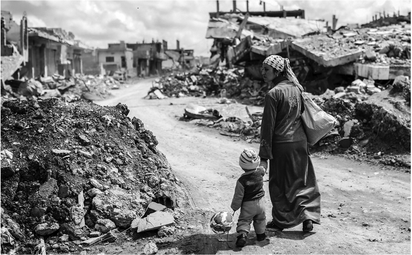
A Kurdish Syrian woman walks with her child past the ruins of the town of Kobane.

of food insecurity and poverty food is also being used as a weapon of war causing many innocent civilians, including women and children, to starve to death. The country has no infrastructure and more than half of the population is out of work and, according to the BBC, the unemployment rate increased significantly from 14% in 2011 to well over 50% currently. The education system has also been shattered with more than 2 million children out of school as most educational institutions have been destroyed or occupied. 1