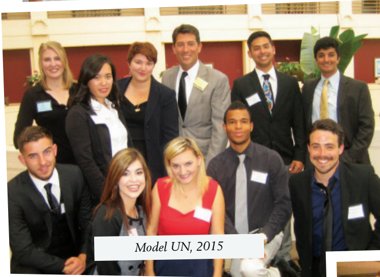
Model UN, 2015