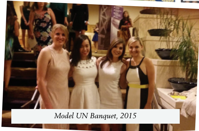
Model UN Banquet, 2015