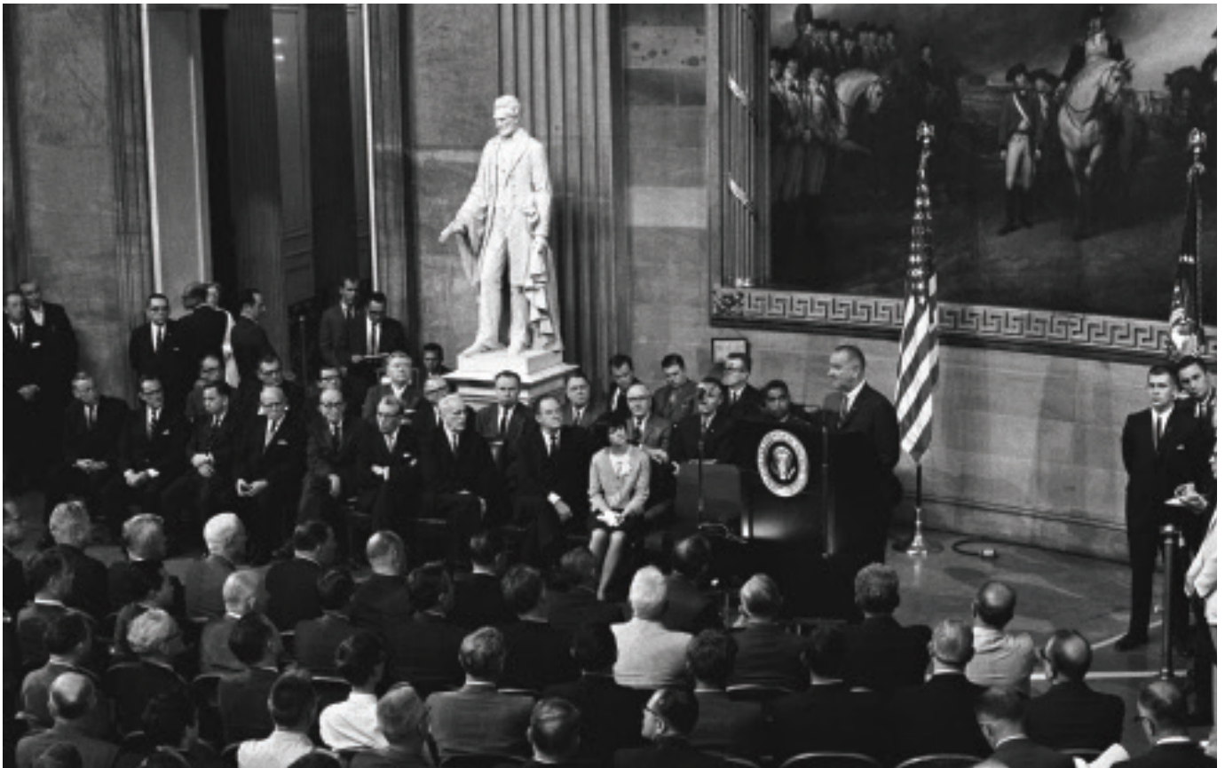
President Lyndon B. Johnson speaking before signing the Voting Rights Act

In order to evaluate perceived “risk”, the FHA rated mortgages on a scale of A - D. A-rated mortgages were those of the upper middle class, usually exceeding a value $20,000 which often times did not need to backing of the FHA. B-rated mortgages were most desirable and most common, usually not exceeding $20,000 in value, and were characteristically defined as properties in all-white suburban areas boasting modest living standards. Urban neighborhoods usually received a “C” rating from the FHA—ethnically diverse neighborhoods on the lower end of the economic spectrum were to be void of the housing investment opportunities extended to their white counterparts. An even lower “D” rating specifically defined black neighborhoods as red zones comprising of several undesirable elements. 4 Residential security maps carved into these four levels of security ratings dictated where economic opportunity would flourish and where it would be severely stifled in the following decades. The creation of the interstate highway system in the coming years would harvest de facto geographic segregation on top of the institutionalized segregation being overtly perpetuated by the federal government at this time. 5