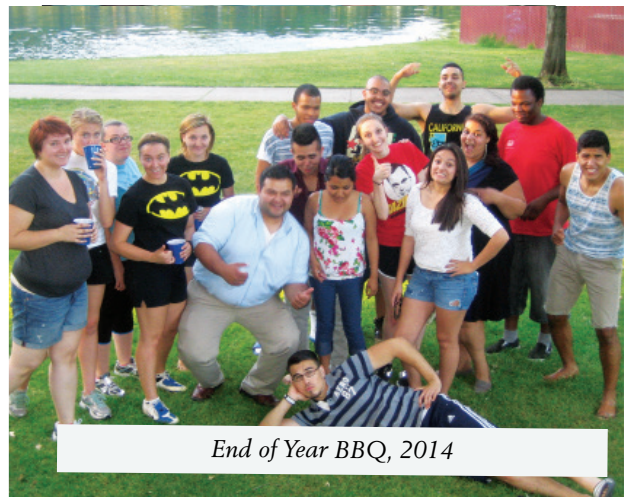
End of Year BBQ, 2014