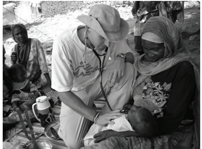
Medecins Sans Frontieres at work.

our patients." 12 These statements appear to be in direct violation of their mission statement, but we will come to find out that occasionally, this happens on a smaller scale. A first hand account was recorded after a routine abdominal surgery. The surgeon performing the operation preformed an unauthorized tubal ligation on the unconscious patient, sterilizing her. The assisting nurse tried desperately to advocate for the patient but failed. 13 This is a prime example of imposing ethics in a foreign context and almost can be viewed as a form of ethnic cleansing depending on how often this occurs and is not reported.