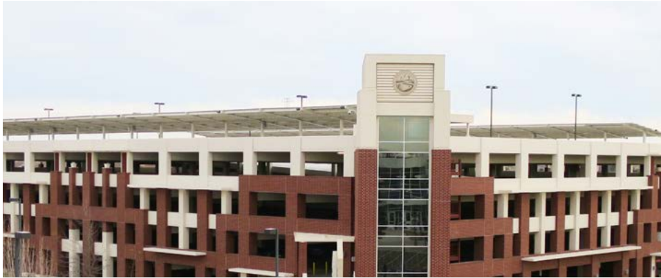
The parking garage's solar panels can be seen in this photo taken from the roof of the Winn Center.

the production capacity of the PV system is about 390,000 kWh annually, approximately 90% of the building's total energy demand—or enough to power about 34.5 homes annually.