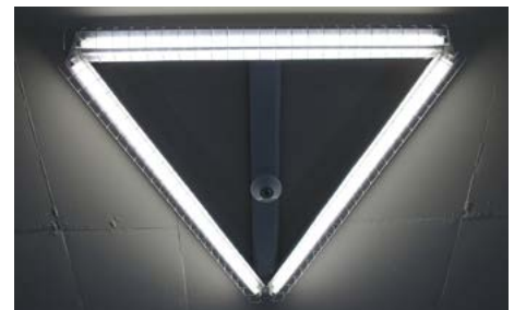
When all three lamps are on in one of the garage's high-efficiency lights, light shines in all directions.

Next time you're in the garage, look up to the ceiling to see these triangular-shaped lights, designed to throw light in all directions. Many fixtures have occupancy sensors that turn the light on when a person or vehicle triggers the sensor. For safety reasons, some fixtures remain on 24 hours a day while others keep only one of their three lamps on all the time, the remaining two coming on as needed. ♦