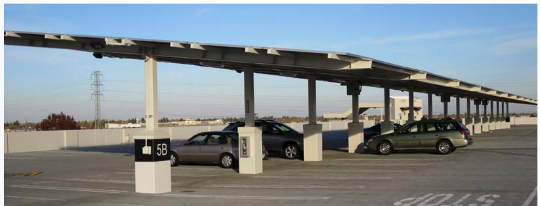
Solar panels on the roof of the parking garage provide power as well as shade for parked cars.