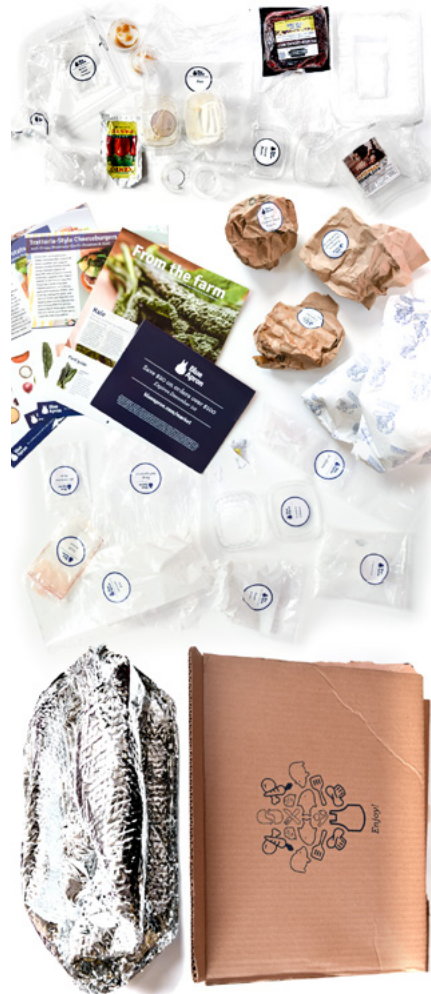
Typical meal-kit packaging looks like this.

But the real surprise, it turned out, was the two massive gel-filled ice bags lining the bottom of the box, way too large to keep in my freezer for reuse. As I searched the Blue Apron website